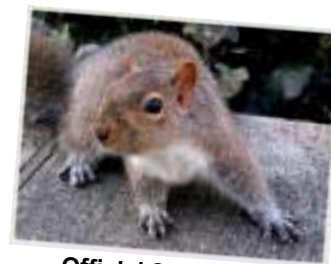
Official CE Mascot